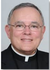
Archbishop Charles Chaput

SPONSORED BY THE ARCHDIOCESE OF PHILADELPHIA