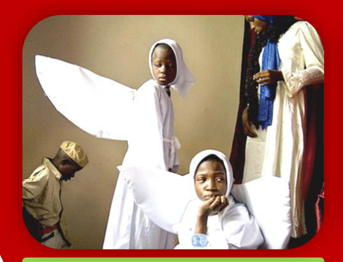
Nativity Play practice in the Dominican Republic