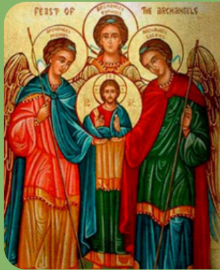
STS. MICHAEL, GABRIEL, RAPHAEL, ARCHANGELS