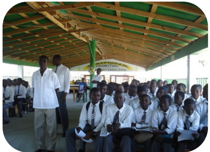
Teachers and Students at Free High School in Cite Soleil, Haiti shown below

In our Resources, you will find activities for various ages and school levels; pre-school, elementary, special education and even Secondary Schools and High Schools!