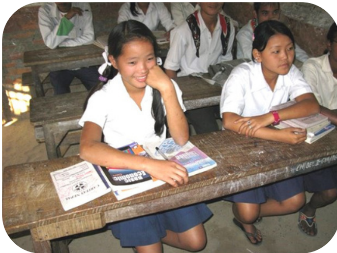
Two High School students at their “desks” learning in Bhutan, a landlocked country in East Asia