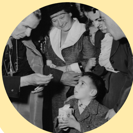
To the left Archbishop Fulton Sheen gives to a young boy's Mite Box