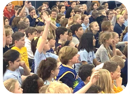
Students at OLMC

The school visits can be scheduled for your entire student body,