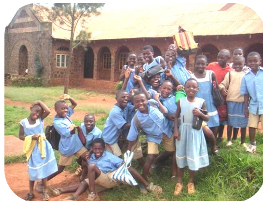
Children at a school in Haiti supported by MCA