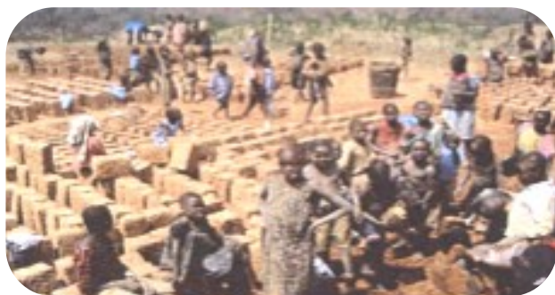
Children helping to build their own school in Kumbo