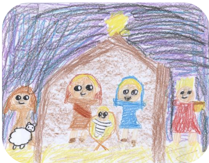
Emily Gauge Saint Anastasia Grade 2