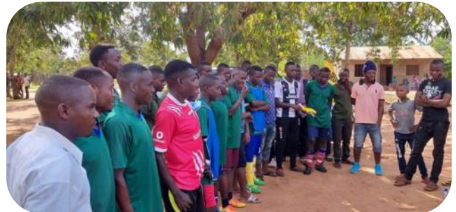
Seminarians from the Archdiocese of Mbeya

A sacrifice of $25 [or $1 dollar from each student] helps buy textbooks and paper in the Missions