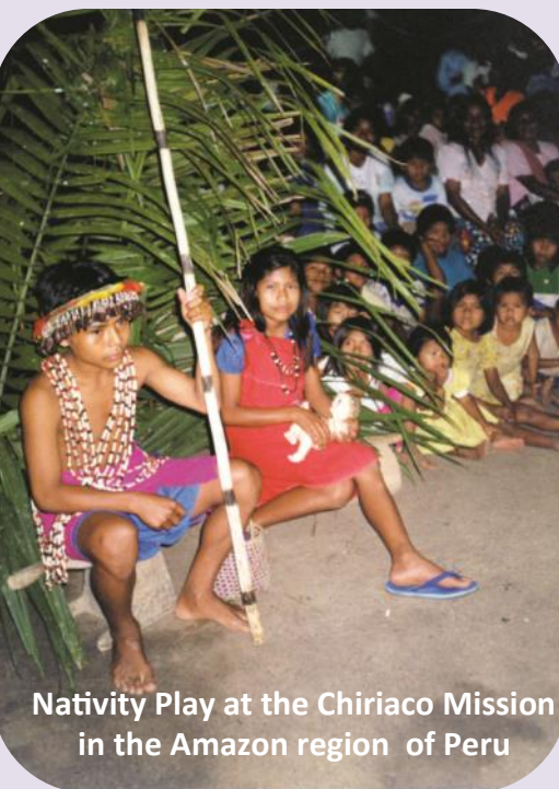
Nativity Play at the Chiriaco Mission in the Amazon region of Peru