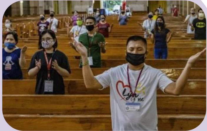
Parishioners in Manila still celebrating Mass and asking for God's help in the midst of the pandemic

Click HERE to access a virtual Advent Wreath to light with your students each week